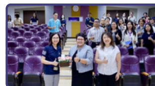
Faculty of Agriculture