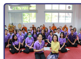
Viengping Children's Home Chiang Mai