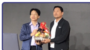
Faculty of Humanities