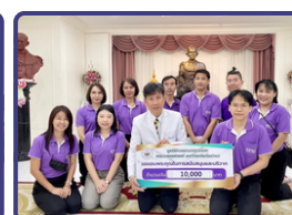
Northern Region School for the Blind Under the Royal Patronage of Her Majesty the Queen