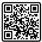
Download Application Form